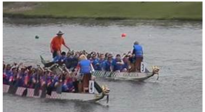
DRAGON BOAT FESTIVAL