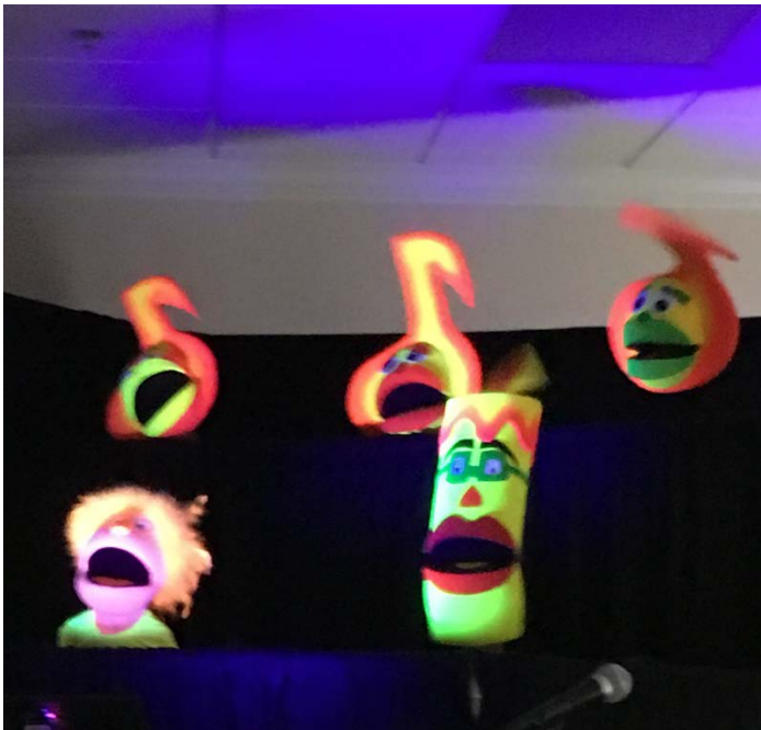
Uniquely HIS (Hands Interpreting Scripture) presented our Blacklight Program May 17th. A BIG "Thank You" to all who attended!